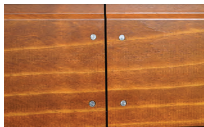
Accoya Modified Wood Pristine after 5 years exposure.